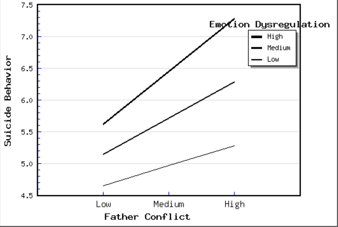
Interaction of Emotion Regulation and Father Conflict